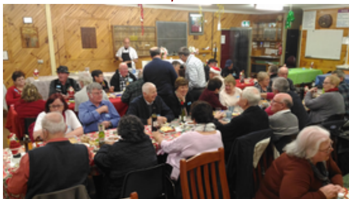
Xmas in July was a great night for many "Woodies"

Thursday nights, Furniture Group with Carvers Group